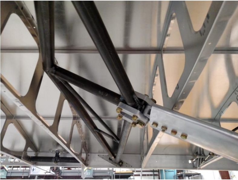
Detail of the internal wing truss and strut connection, no official bolts were used in the test fitting.