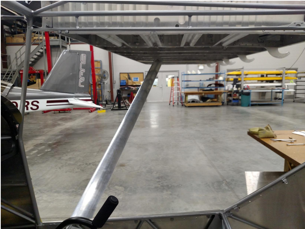
Looking at the single strut from the pilot seat. This is going to be a very common sight in the near future.