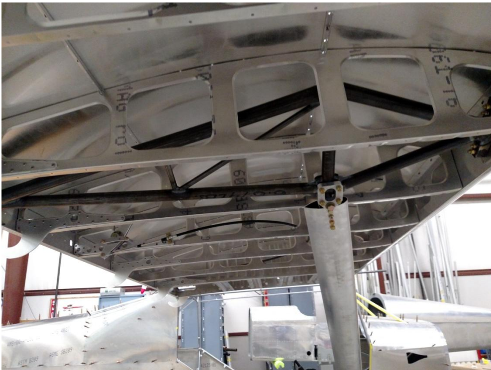
The internal wing truss fits neatly up inside the wing, aligned with the load path of the lift strut.